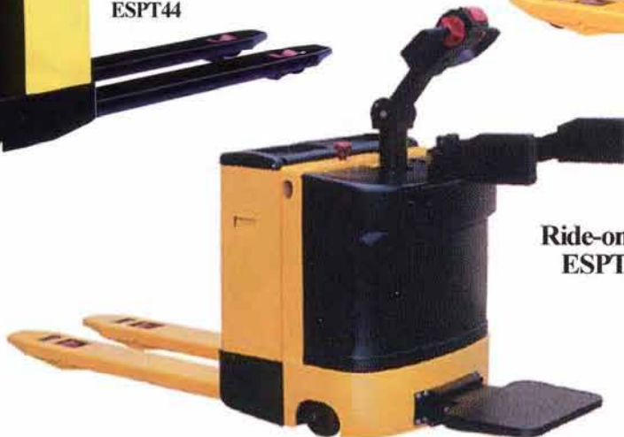
Ride-on model ESPT44-R

Capacity: 2,200 lbs. Raised Height: 8" Lowered Height: 3.3" Fork Size: 6.5" x 48" Overall Fork Width: 20.5" or 27" O.D. Overall Length: 69" Overall Height (top of handle): 48.5" Turning Radius: 67" Drive Wheel: 10" diameter Polyurethane Load Rollers: 3" diameter Polyurethane Travel Speed (with load): 1.6 - 2.4 mph Battery Voltage: 24 volt (4 batteries) Charger: 24 Volt Weight: 330 lbs.